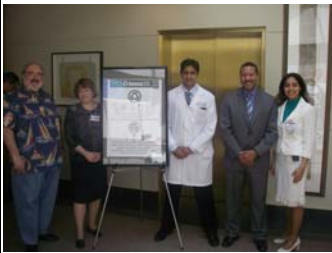
Green Leaders at Washington DC Seminar in May – Co-hosted by Inova Health System

In 2009, the Health Care Council visited 15 U.S. and Canadian cities offering 21 independent seminars, educational sessions at national conferences and networking events as well as tours of the Green Patient Lab. We hope every member has taken advantage of something we've offered. If not, we hope to see you in 2010!