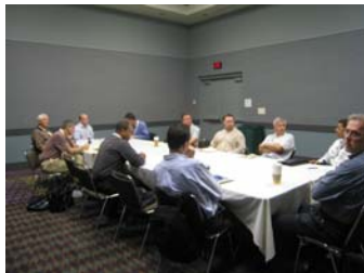
At World Work Place, the HCC hosted an open forum to share

news about the council and discuss major issues facing health care today.