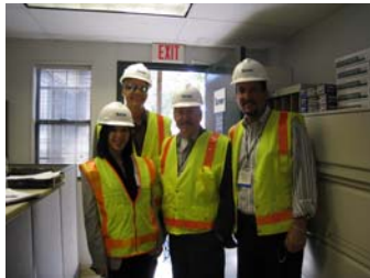
At our Spring Conference in San Francisco, members toured Laguna Honda Hospital.