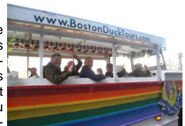
Spring Conference Attendees touring Boston on the Boston Duck Tours

Then the fun began with the Duck Tour on the Charles River and through the downtown streets of Boston. It is amazing how traffic will get over or let you in when you are in an old army amphibious vehicle. We then went to one of the meccas of baseball, Fenway Park for dinner.