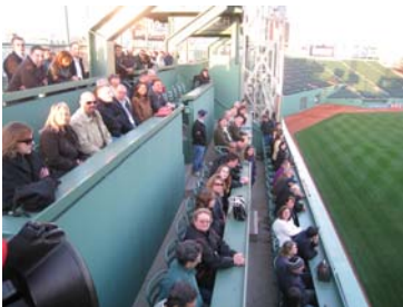
Spring Conference Attendees enjoy a tour of Fenway Park

As we mentioned in the first quarter newsletter, CHES and IIDEX, have joined together to bring the GPR to Toronto to be the center piece at each conference. Partnering with CHES will continue our relationship with ASHE and partnering with IIDEX will assist us in building our Toronto IFMA relationship.